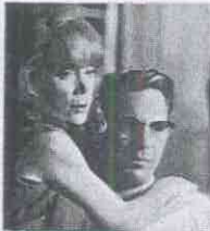
Spacek and Costner: Stone charges that Garrison has been portrayed by a hostile press as a look-a-new Huey Long.