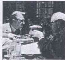
Top: The real Jim Garrison in 1967. Above: Kevin Costner playing the New Orleans D.A. Stone made Garrison's Capraesque story the spine of his movie.