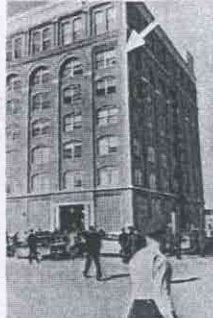
Did the shots come only from this building? The Warren Commission says yes, but many—including the House Select Committee on Assassinations, Garrison, and Stone—say no.

election victory, he could move forcefully to end the Cold War.