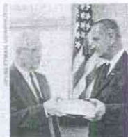
Lyndon Johnson receiving the "Warren Commission Report" from Earl Warren