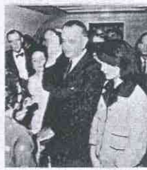
Lyndon Baines Johnson, with Jacqueline Kennedy, being sworn in as the 36th president of the United States. Under his administration, the U.S. escalated the Vietnam War.