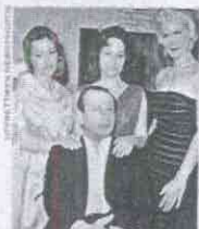
Above: The real Jack Ruby and his "girls." Below: The real Ruby shooting the real Oswald