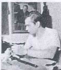
Center: Mug shot of the real Lee Harvey Oswald. Above: Gary Oldman as Oswald

his lines verbatim from transcripts and news footage.