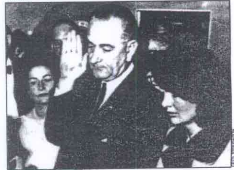
Blood-Stained Moment Lady Bird, LBJ and Jackie stare into history as Johnson takes the oath.

We'll never know who killed John Kennedy. But we know enough. We know that our myth-making zealotry has made every theory valid and every preposterous scenario true. We know that Kennedy's death was overdetermined; we have concocted a thou-