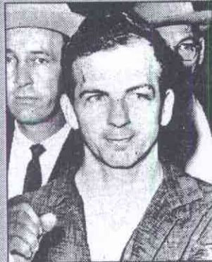
OSWALD: Officially the lone killer of President Kennedy

► PBS will rerun the 1988 documentary Who Shot President Kennedy Feb. 25.