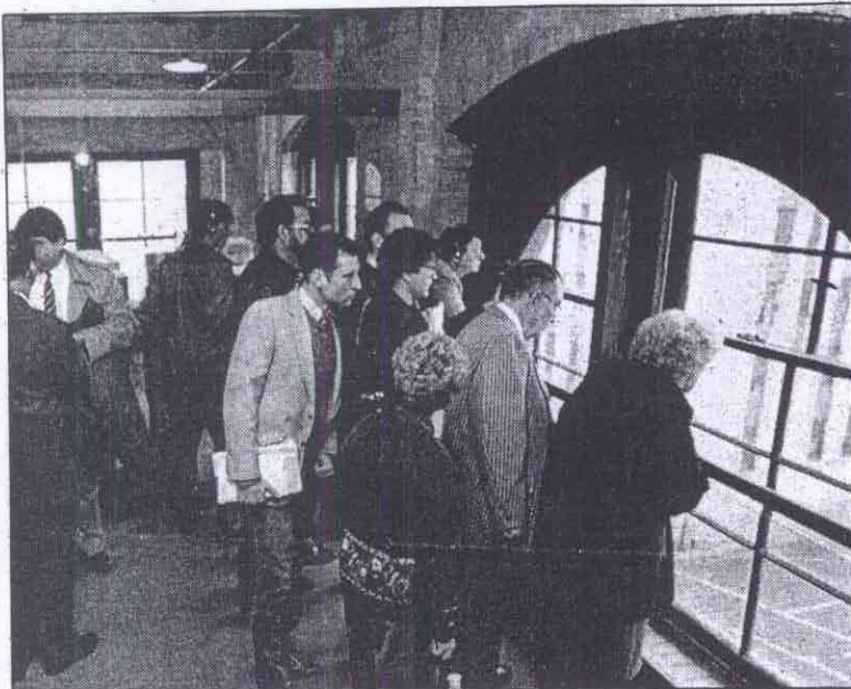
Visitors tour the Texas School Book Depository in Dallas, one of the sites where the movie 'JFK' is being filmed.

Stone began filming recently at Dealey Plaza, near the site where John F. Kennedy was assassinated 28 years ago. Several hundred people watched as production crews readied a replica of the presidential motorcade. Led by two four-door, 1963 convertibles — a black Cadillac Fleetwood and a Navy-blue Lincoln Continental — the motorcade was assembled on Main Street, as it prepared to track the route that Kennedy had