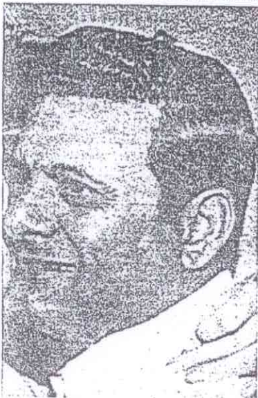
They are two of the key figures in the JFK investigation.

Means was by gunshot. Again, it's difficult. (See COVER-UP, Page 14)