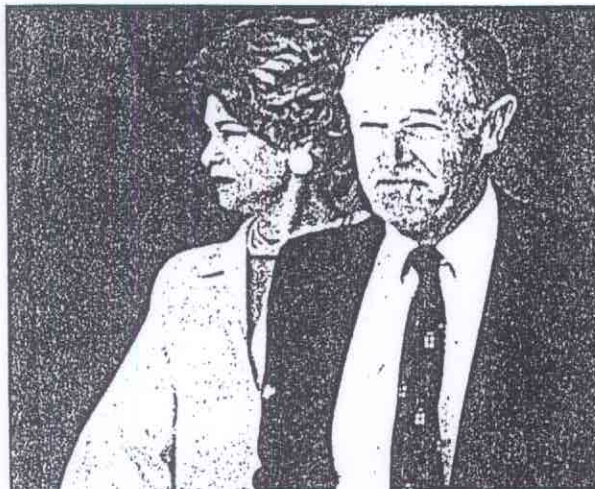
Watergate burglar E. Howard Hunt and his wife Laura are pictured in Miami during the trial that pitted Hunt against this newspaper and its publisher.