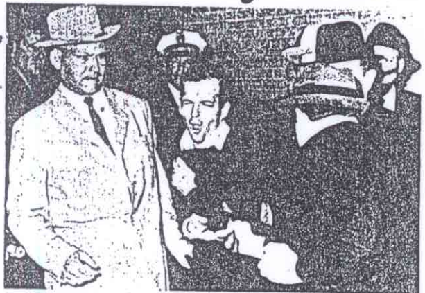
Lee Harvey Oswald (center) is conveniently murdered by Jack Ruby (right, back to camera), making it impossible for Oswald to testify in court.

Garrison went on to explain how stories about Lee Harvey Oswald as presented by the Establishment media, and the Warren Commission could not be true because of evidence he had developed. He showed, among other things, how a bullet could not