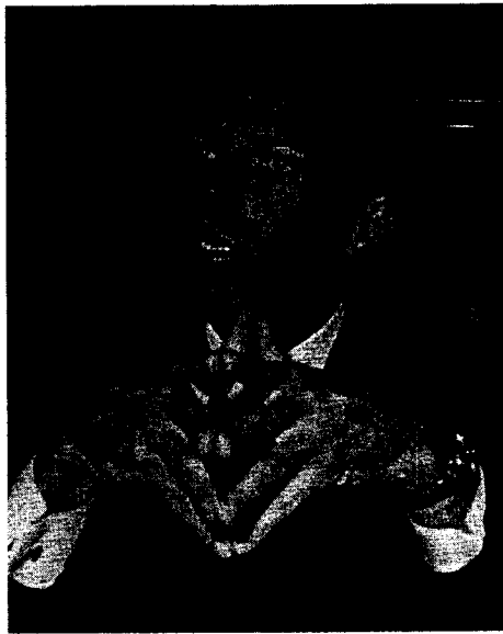
LABOR M.P. &amp; FINANCIER JOHN STONEHOUSE

A life, and perhaps a death, that was stranger than fiction.