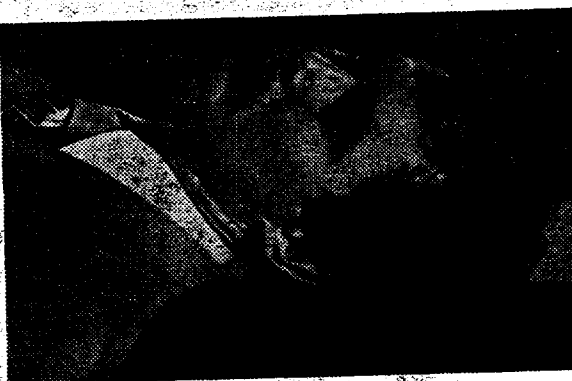
"I warned him, he wouldn't listen,"