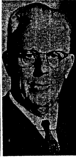
Chief Justice Earl Warren

The disappearance of the X-rays and photographs, the dispute over the autopsy report, conflicting eyewitness testimony over the number of shots fired and their direction, the strangely intact condition