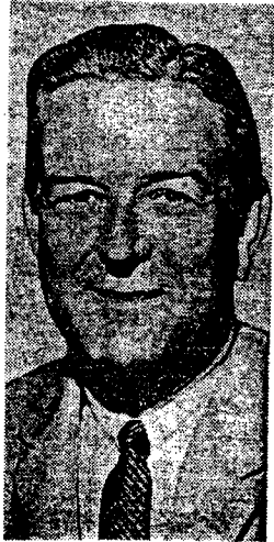
Gov. John B. Connally

A major argument against the single-bullet theory is based on testimony offered by Connally. In his appearance before the commission, Connally steadfast-