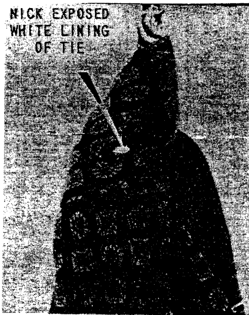
ONE OF THE PHOTOS in FBI Exhibit No. 60 indicates a nick found in President Kennedy's tie.

Using the maximum amount of time available under these circumstances, it is clear that