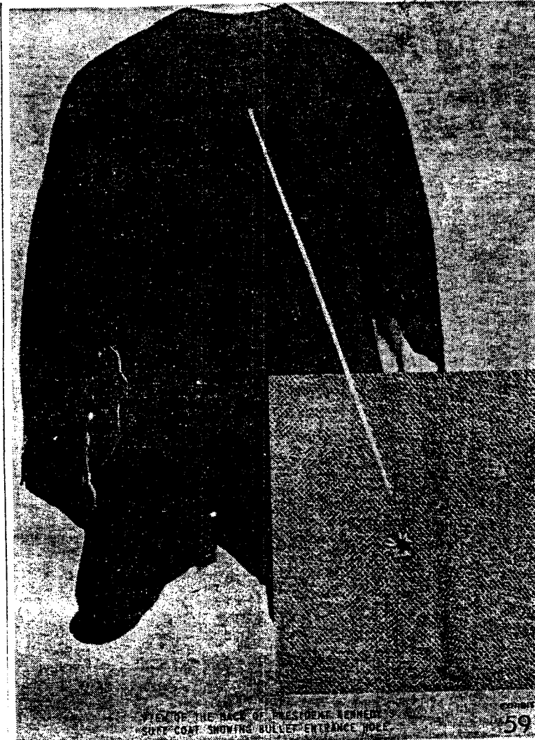
VIEW OF THE BACK OF THE STARK KENNEDY WINTER COAT SHOWING BULLET ENTRANCE HOLE 59 FBI EXHIBIT NO. 59 pictures the back of the coat, and an enlarged section of the garment, worn by assassinated President John F. Kennedy.