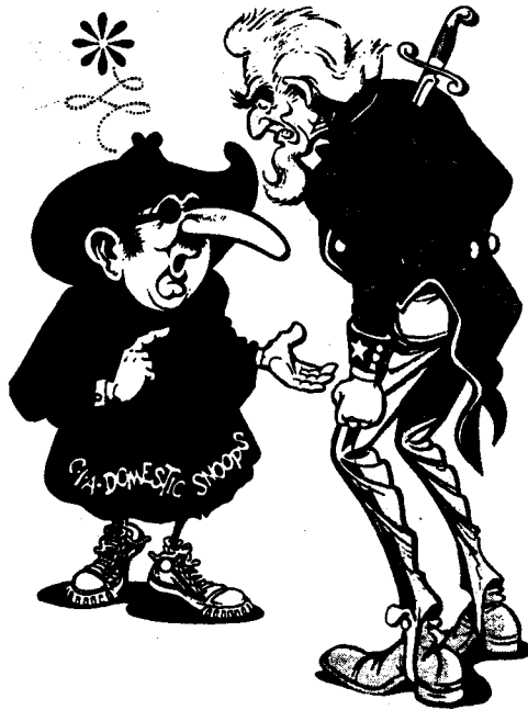
Hugh Haysie © 1974, Louisville Courier-Journal 'Pardon me, ol' timer . . . but it seems that I've mislaid my dagger . . .'