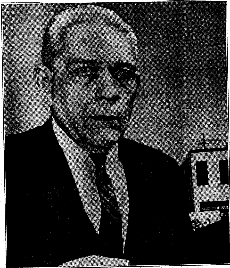
Businessman Clay Shaw, 54, arrives at court house in New Orleans for preliminary hearing at which he was dramatically linked with Lee Harvey Oswald in the assassination of President Kennedy. District Attorney Jim Garrison supported his charge of an assassination plot by producing his mystery witness, insurance salesman Perry R. Russo, 25, who told the hearing that Oswald and Shaw discussed the murder of Kennedy two months before the Dallas tragedy.