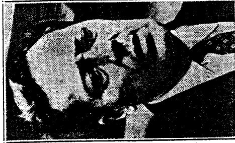
District Attorney Garrison Brings forth his witness

he had uncovered a plot to assassinate the President.