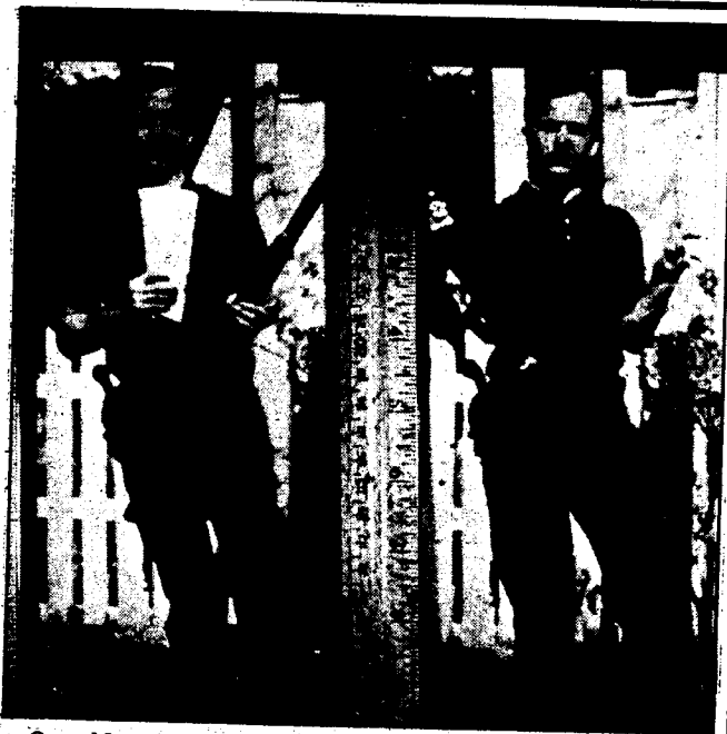
Oswald and Oswald imposter? The Schweiker Committee finds mislabeled documents and overclassified material.

'According to Schweiker, "Ruby had to have been at least working for someone who was working for the CIA."'