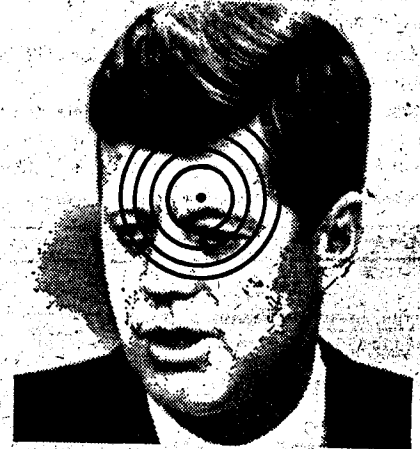
JOHN F. KENNEDY Sniper death still shrouded