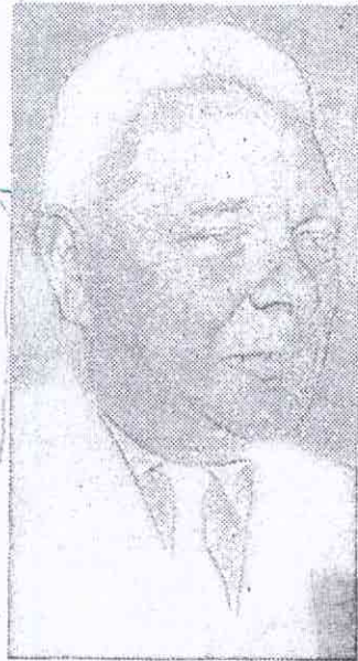
REP. HALE BOGGS Didn't Care for Idea