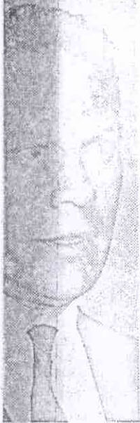
GERALD FORD Emphasized