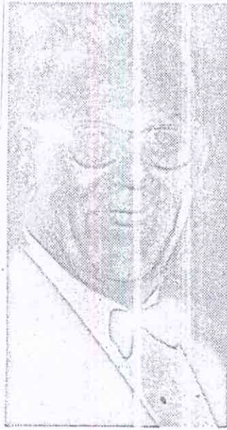
CHIEF JUSTICE WARREN Chose General Counsel