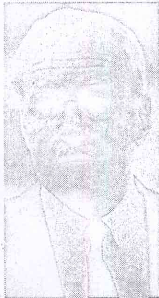
ALLEN DULLES Former CIA Head