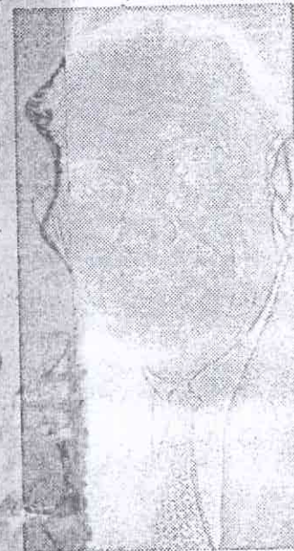
PRESIDENT JOHNSON He Telephoned Again

The reason: The interrogation of witnesses seemed to him to