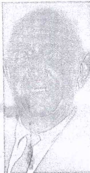
SEN. RUSSELL Great Dissenter