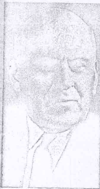
JOHN J. McCLOY Took Credit for Word