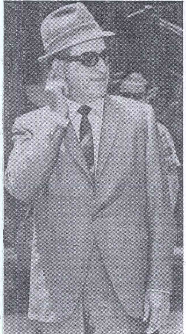
Chicago Daily News