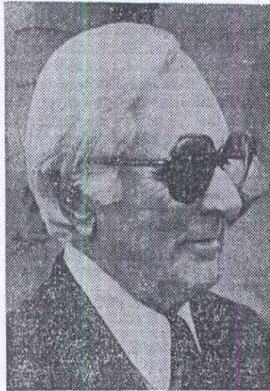
John Rosselli

like that, you have to go to your people and ask them what to do," the Mafia figure said. "Rosselli not only did not come to us, he went before the committee and shot his mouth off all over the place."