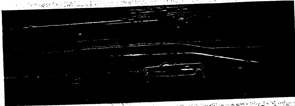
fig.3. The 6.5 Mannlicher-Carcano broken down into its twelve separate components. Grand Prairie, Texas, Saturday 25th June 1994.

Finally - I had practised many times before undertaking my 'real attempt' at putting the gun together. I knew precisely where each piece was and where and in what order it should be fitted. I knew when I had to change the position of the rifle from horizontal (across my lap) to vertical (between my knees).