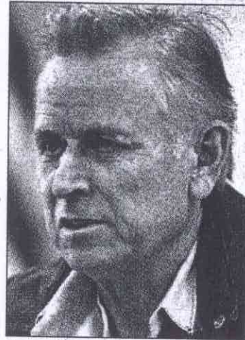
JAMES EARL RAY

An unusual coalition of supporters gathered around Ray as he continued to press his claim. King's widow, Coretta, and his son, Dexter, embraced Ray's claim of innocence and joined in his call for a trial and new in-