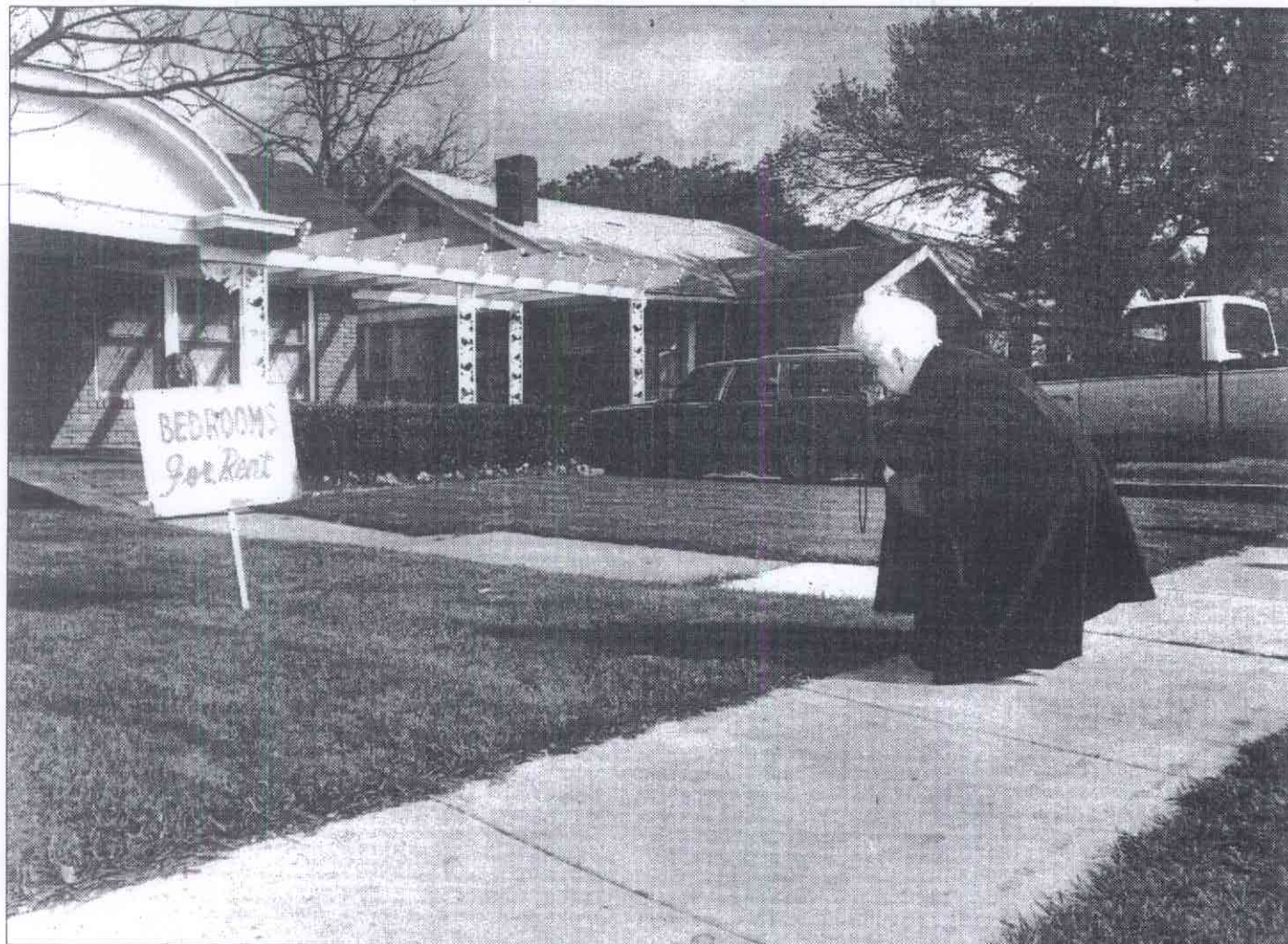
FATAL ATTRACTION: Every day tourists stop outside the house where Lee Harvey Oswald lived.