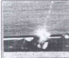
IMPACT: JFK's head snapped back.