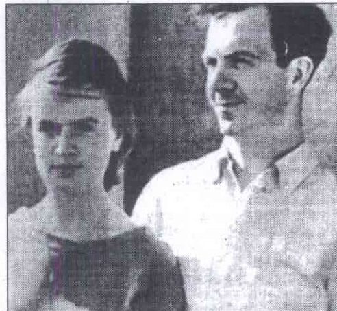
LOVERS: Oswald and Marina in Minsk. She would later become his wife.

Too much was at stake. Several weeks earlier, Eisenhower and Khrushchev had thawed the Cold War at a summit in the Maryland countryside, and the Kremlin did not want "the spirit of