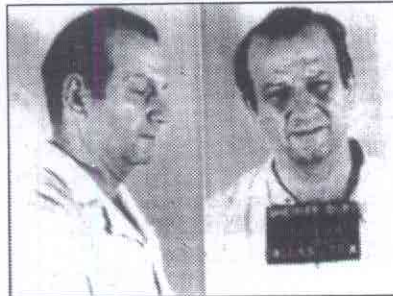
JACK RUBY: Police file photographs.

Beset with financial troubles, he appeared on the verge of an emotional collapse after JFK's death. He closed his two nightclubs out of respect, wept openly and wailed that he and other Jews would be blamed because a strongly anti-Kennedy ad in a Dallas newspaper the day of the killing was signed with a Jewish name.