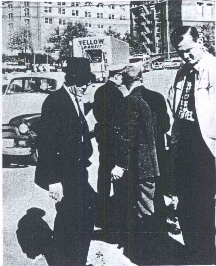
Unidentified "F.B.I." man walks off with evidence firmly clutched in his left hand while Dallas county and city law officers watch.