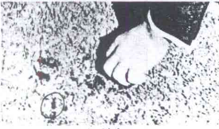
.45 calibre slug about to be picked up.

President was well within fifty feet of the manhold, from which Senator Yarborough saw smoke emerge.