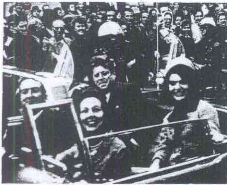
President Kennedy in Dallas shortly before his murder.