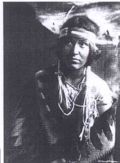
This romantic portrait of an American Indian is called "On the Great Divide"