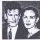
Lyle and Julia

again." Lovett says he and Julia have remained good friends — and