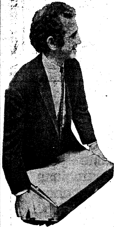
Daniel Ellsberg holding a boxful of the government edition of the Pentagon Papers.