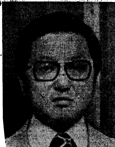
TONGSUN PARK tried to destroy list