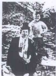
Lee Harvey Oswald was almost six when he visited Arizona with his mother.