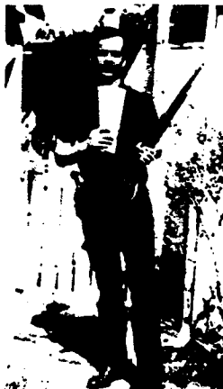
The lone assassin? Lee Harvey Oswald, with the rifle that investigators said was used to kill John F. Kennedy. Grief and fear: Marina—shown at Oswald's funeral—was afraid she and her children would be shot, too

with the accent of her native Russia, but Marina—forty-seven, trim, self-assured, with extraordinary blue eyes that are peaceful but piercing in their intensity—is very different from the terrified young wife and mother of 1963. Back then, she was twenty-two and had come to the United States from the Soviet Union only seventeen months before. She had met Oswald, an ex-Marine who had tried to become a Soviet citizen, in Minsk, where he was working. He had married her and brought her to Texas. Marina could not speak English, and she understood very little about America.