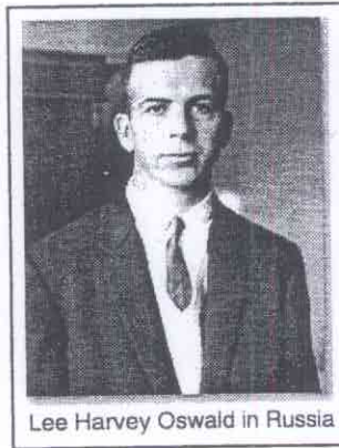
Lee Harvey Oswald in Russia

A State Department translation of one of the Russian language documents shows that on the day of the assassination, Nov. 22nd, 1963, Soviet Ambassador Anatoly Dobrynin sent a top-secret coded telegram marked "highest priority" from Washington to the Krem-