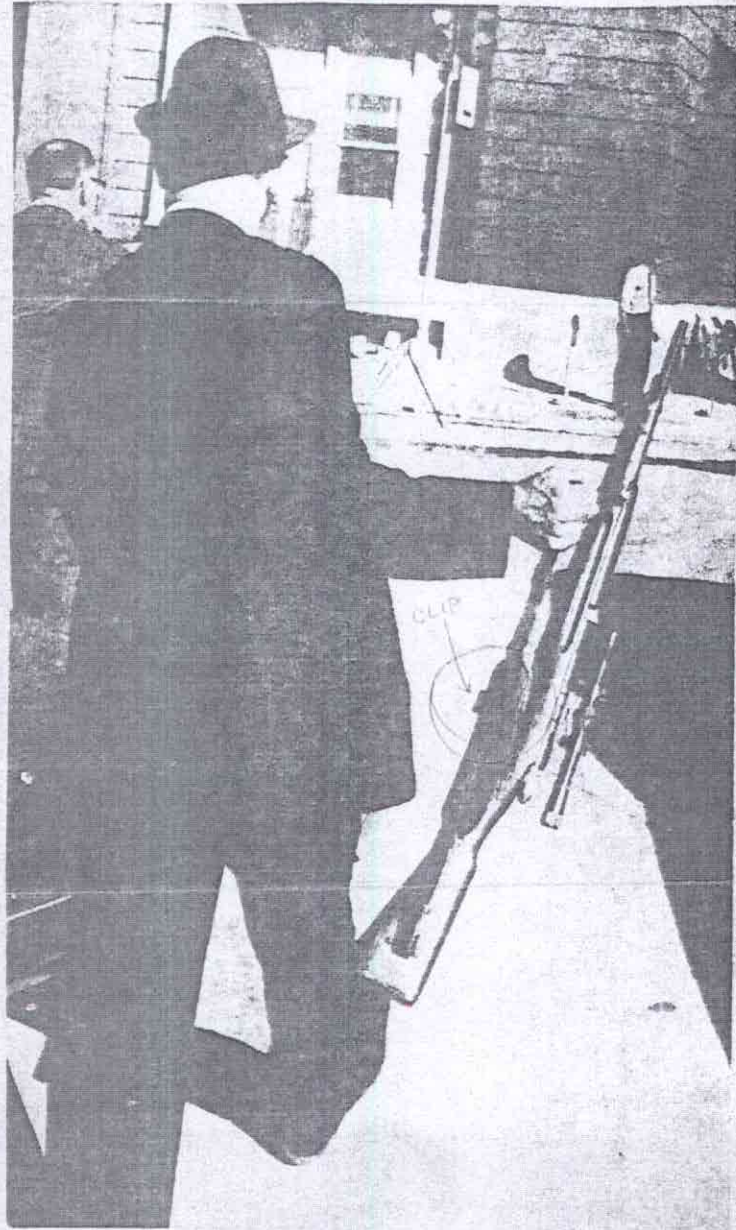
SEE note on the back of this