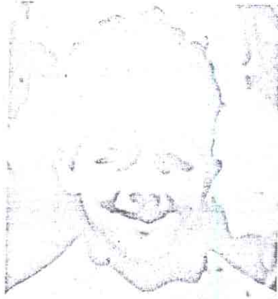
Lee Oswald: Curly schoolboy ...