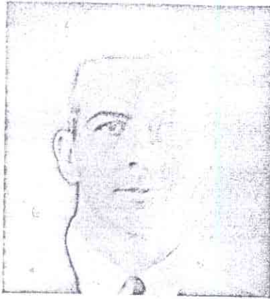
... lone young man ...