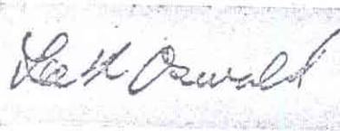
... and his signature