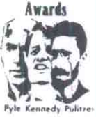
Pyle Kennedy Pulitzer