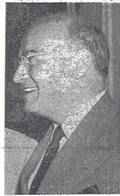
CONGRESSMAN E. CELLER

tanks and airplanes has now caused the Moslems to sing a different tune.