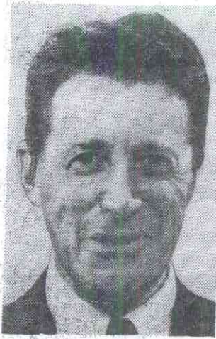
CASPAR WEINBERGER ... says detailees listed

committee treats him pretty much with kid gloves and no President is anxious to change that."