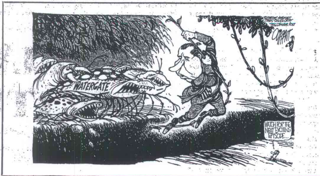
"By golly," cried Dick as he swung to safety, "someone will pay dearly for this!"

The Watergate crisis, as already noted, is not over by a long shot. The current post-decision period of "greatest danger" that he described in "Six Crises" may be no more than an interlude in what many now are calling his Seventh Crisis. The Nixon-watchers—and we are by now a nation of them—will be observing him assiduously to see whether he can continue to follow his own advice against letdown and consequent error or irrationality. For the country's sake, Republicans and Democrats alike must hope, in the critical days and weeks ahead, that he will.