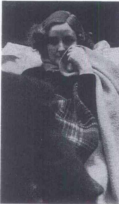
UNITY MITFORD IN 1940 Germany was his bride.