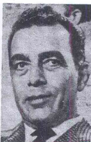
C. G. (BEBE) REBOZO