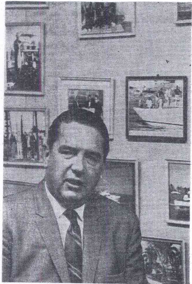
The New York Times

Where are the documents that illustrate the transactions described by the White House? (As of two days ago, property