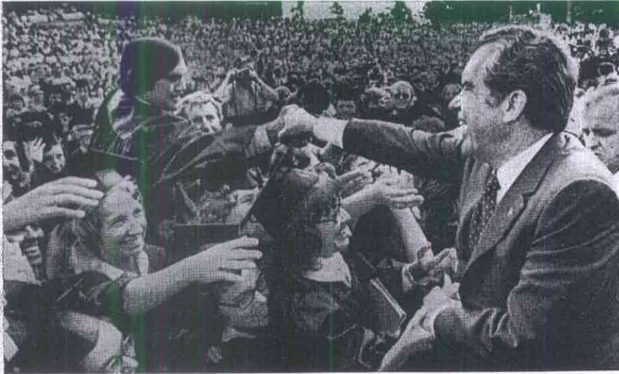
NIXON WITH GRADUATES OF FLORIDA TECHNOLOGICAL UNIVERSITY IN ORLANDO Talking once again about what is right in America.

Moderate Republicans also were critical. At the National Governors' Conference along Lake Tahoe, Michigan's William Milliken said of Nixon: