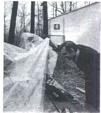
Richard Nixon may be growing fonder of the presidential retreat at Camp David, but the White House press corps isn't. Not only are reporters kept out of the camp itself (they are allowed brief glimpses inside from one designated spot on the perimeter), but the facilities are minimal. Last week, when the President was making a lot of news by announcing cabinet shifts, the ten telephones inside the small press trailer were not enough. In a steady rain, reporters had to use phones set up on picnic tables outside, huddling under sheets of plastic. Press Secretary Ron Ziegler showed up (above, with the press trailer in the background) to inspect the correspondents, but he didn't invite anyone inside.