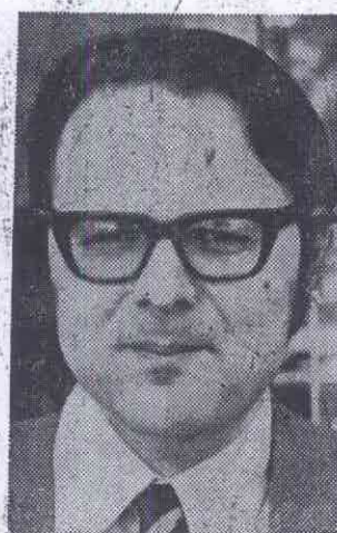
SEN. CLIFFORD P. CASE MORTON H. HALPERIN ... two give views on maintaining U.S. troops in Europe

mon approach on all other issues "overloads the circuits of the alliance," Warnke contended, in arguing that NATO is primarily a defense alliance.