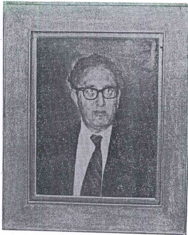
Portraits of Henry and Nancy Kissinger ...