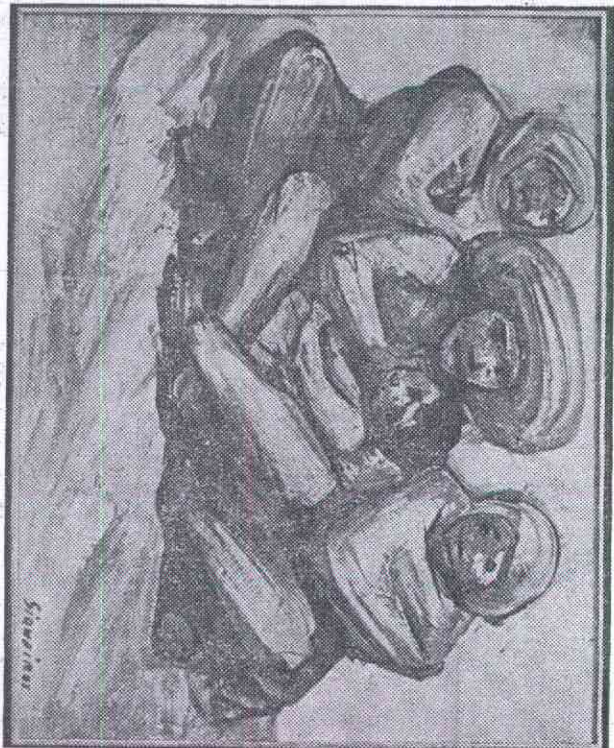
From left, the Russian icon from Nelson Rockefeller, a portable bar with pipe and tobacco from Soviet Foreign Minister Andrei Gromyko, and Mexican President Luis Escheverria's painting by David Siqueiros.