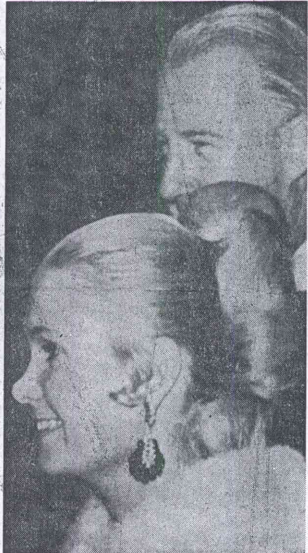
Tricia Nixon Cox wearing ruby and diamond earrings given to her mother in 1971 by King Faisal. The occasion is a $1,000-a-plate dinner which Mrs. Cox appeared at with former Vice President Spiro T. Agnew in March, 1972.