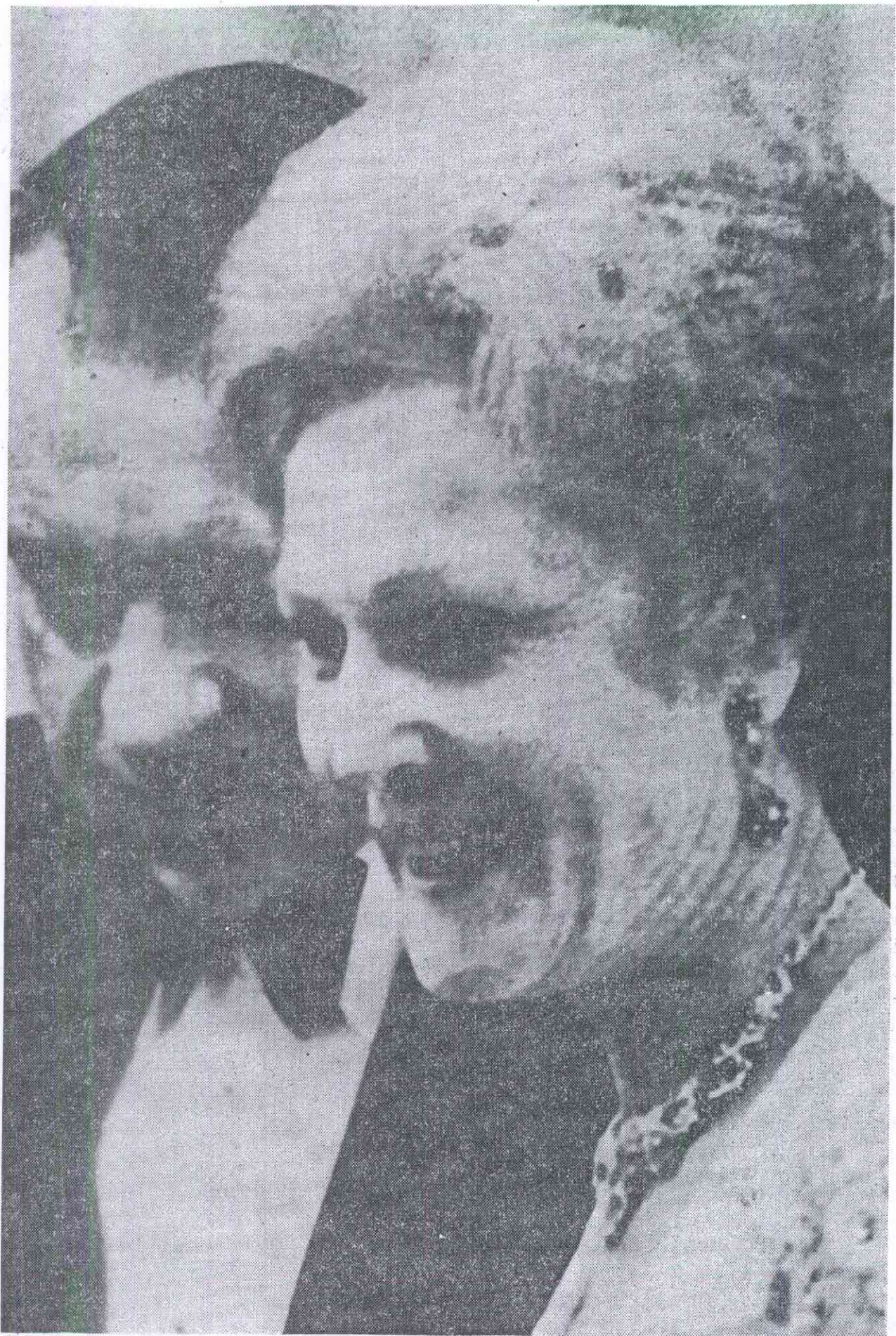
Mrs. Nixon wearing the earrings and necklace from the $52,400 Prince Fahd gift at a White House state dinner for Ivory Coast President Felix Houphouet-Boigny in October, 1973.