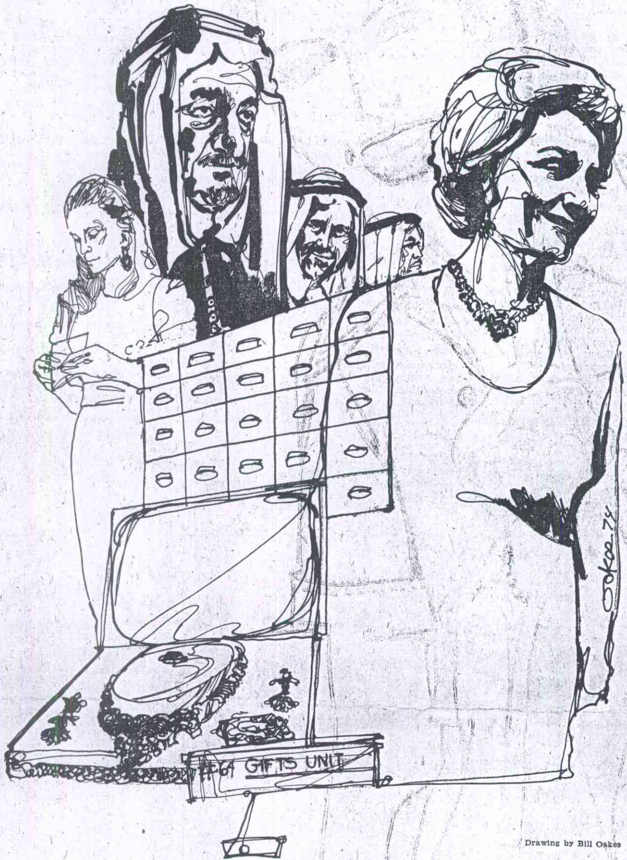
Drawing by Bill Osakes