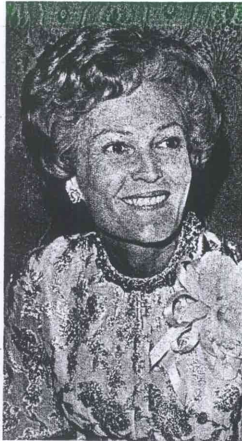
MRS. RICHARD NIXON

Beautiful women who received beautiful gifts and turned them in