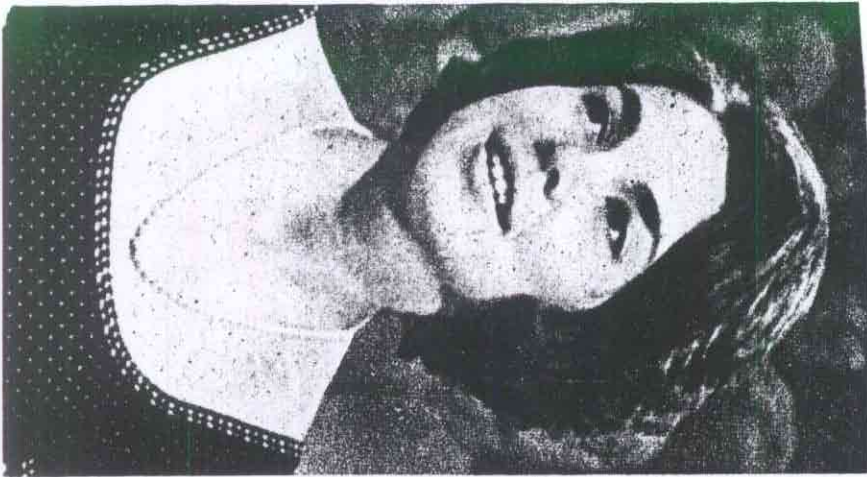
MRS. DAVID EISENHOWER