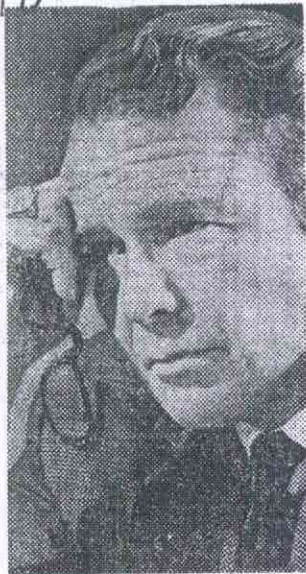
ROBERT H. FINCH ... said to decline offer

While the White House had no direct comment on the proposal, press secretary Ronald L. Ziegler said that Mr. Nixon was pursuing his own inquiry and was determined to find out "what happened, how it happened and why it happened."