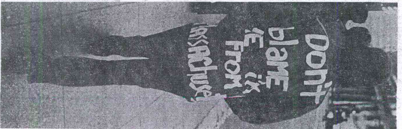
Street scene.