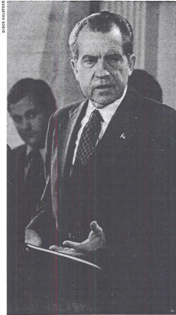
PRESIDENT NIXON AT PRESS CONFERENCE