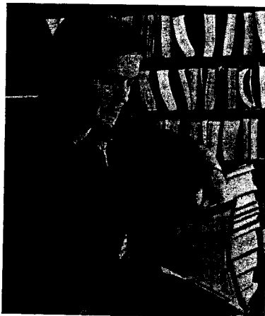
Dr. Kelsey checks records at FDA office.

I told her that I would be glad to call her at her expense each time I saw a patient in my office and ask what treatment to give. In my seven meetings with the FDA staff since November 1965, I have repeatedly encountered the same type of absurd information that Dr. Kelsey originally gave me.