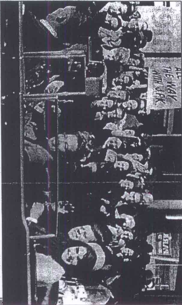
NOVEMBER 22, 1963: More than three decades after the killing of President John F. Kennedy in Dallas, speculation rages over his death. Among the theories: involvement of the CIA, the Mafia, Fidel Castro or the Kremlin.