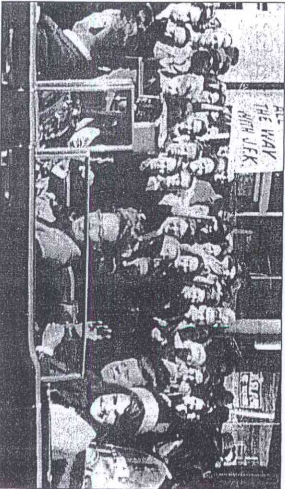
NOVEMBER 22, 1963. More than three decades after the killing of President John F. Kennedy in Dallas, speculation rages over his death. Among the theories: involvement of the CIA, the Mafia, Fidel Castro or the Kremlin.