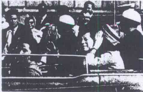
JFK RIDING IN MOTORCADE in Dallas next to wife Jackie and behind Governor and Mrs. John Connally of Texas. Only seconds later, the President was shot.

The shocking discrepancies uncovered by the new evidence appearing in The ENQUIRER can mean only one thing, says