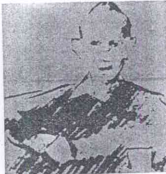
CIA agent Gordon Novel bears a stunning resemblance to the drawing at the right. The drawing is taken from the blown-up photo.