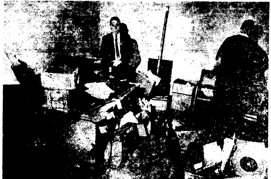
ARSENAL: Detectives inspect and tag weapons and ammunition uncovered in sweeps

Scout camps that he said they were privately owned.